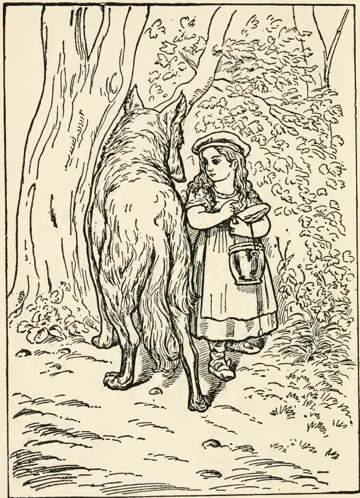
"SHE MET WITH GAFFER 'WOLF.'"